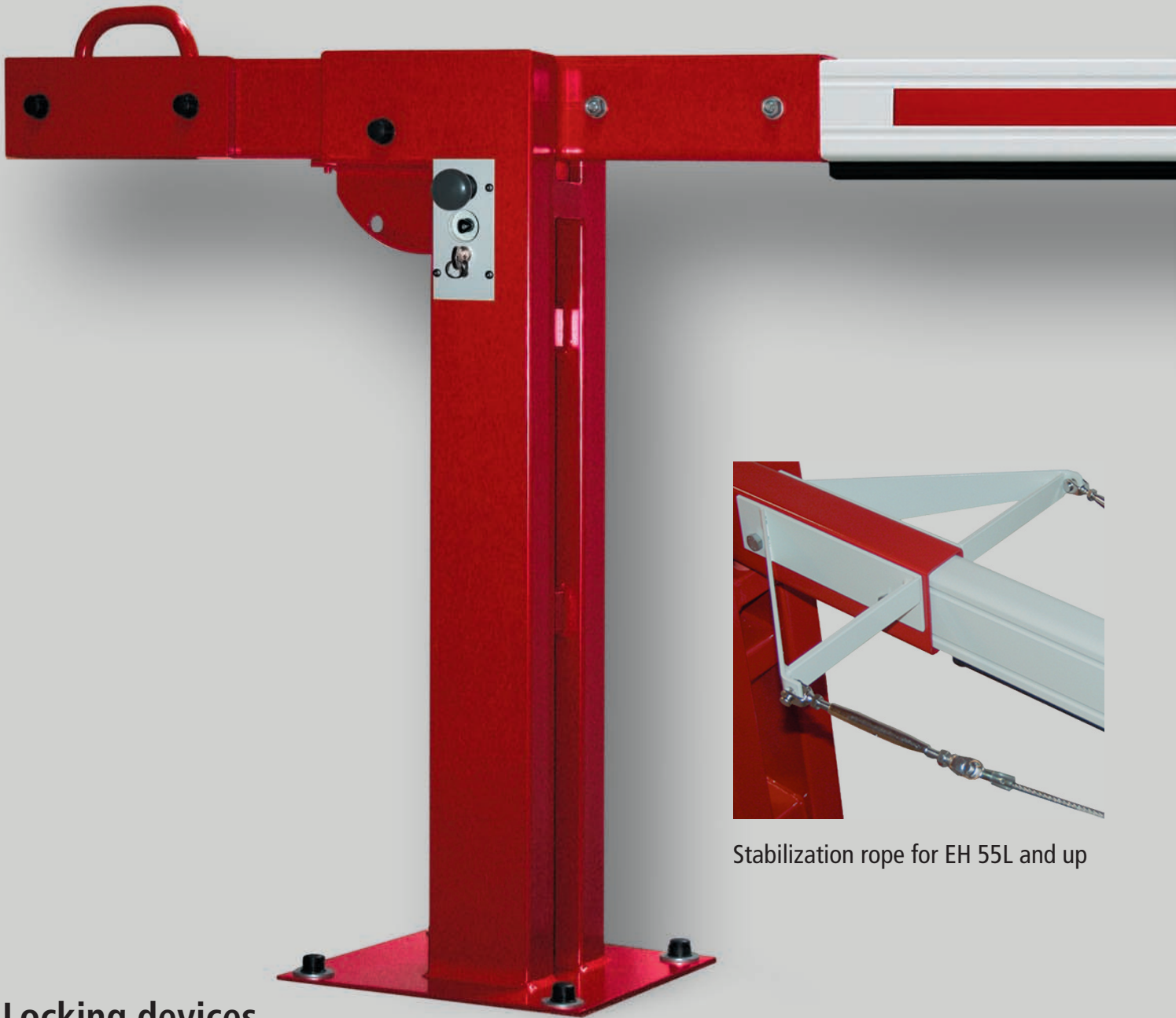
Stabilization rope for EH 55L and up